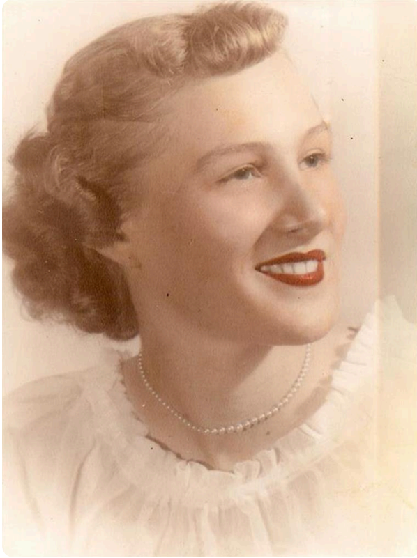
Mom, at 16 years old.